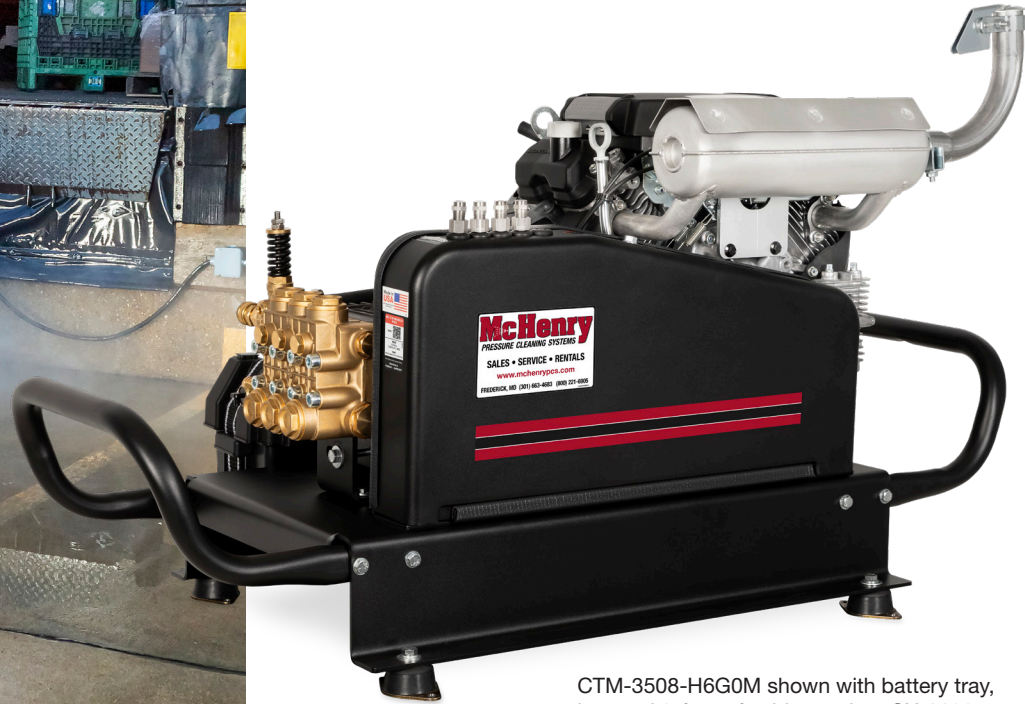
CTM-3508-H6G0M shown with battery tray, box and 2-foot of cables option, CX-0128

This cold-water truck-mount series is designed for mobile cleaning. Mount it to a truck or trailer with a water tank and clean anywhere, anytime. It's ideal for industrial cleaning and remote locations.