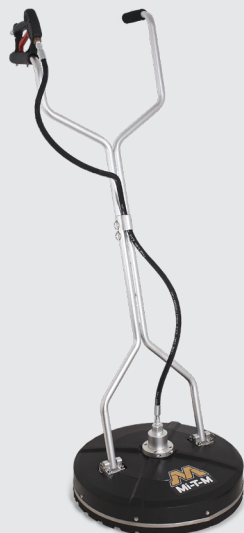
Rotary Surface Cleaners Use on decks, patios, sidewalks, parking lots and any other horizontal surface