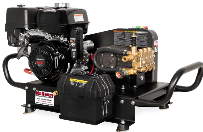
CTM-3005-H6G0M shown with electric start option, CX-0127 and battery tray, box and 2-foot of cables option, CX-0128