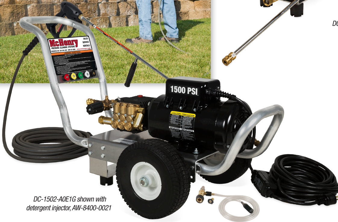
DC-1502-A0E1G shown with detergent injector, AW-8400-0021